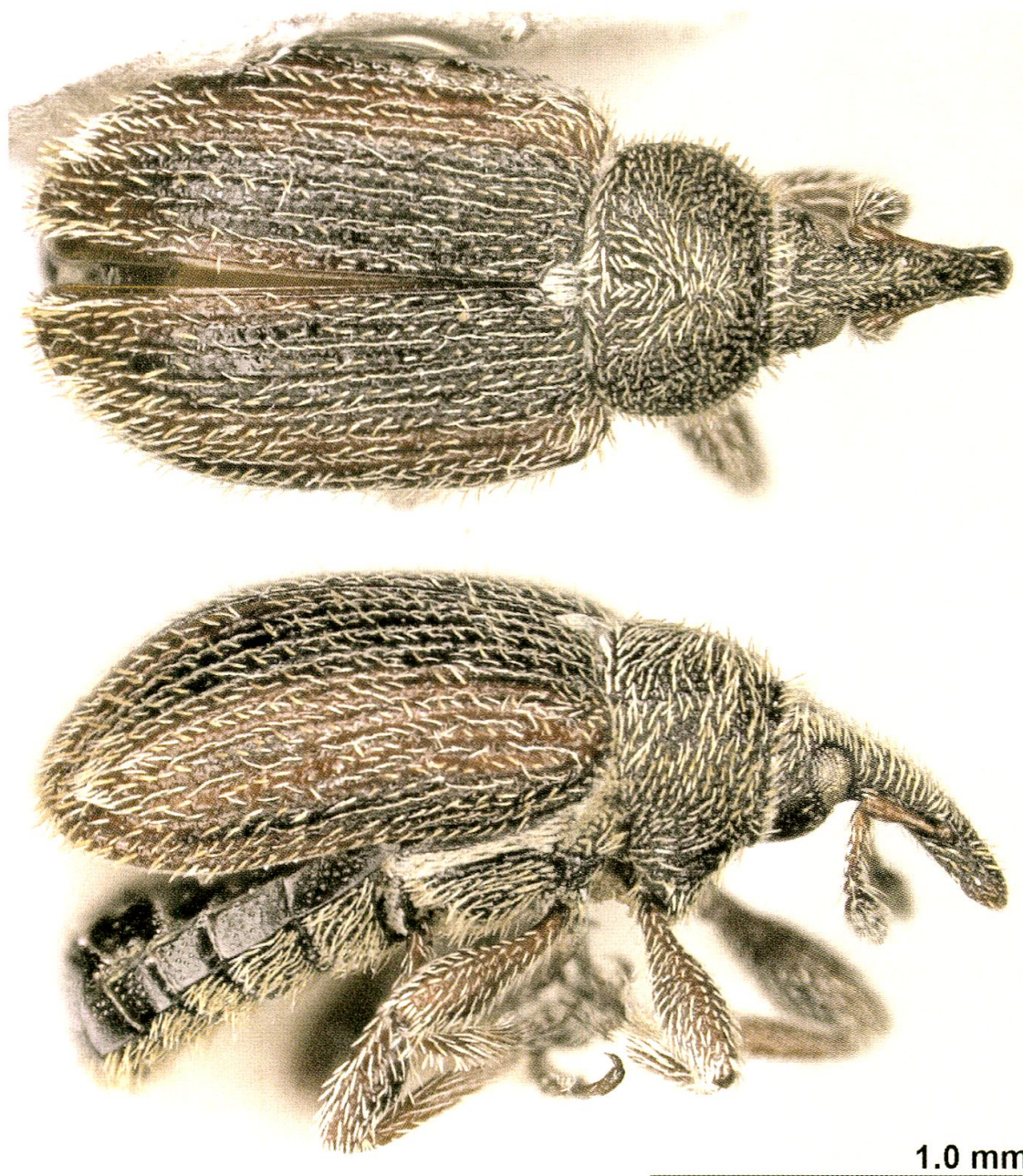
Fig. 1. Habitus (dorsal, lateral) of the adventive Gymnetron rotundicolle Gyllenhal, 1838, canton Ticino, Porza. The photos were taken using the VHX-2000 photograph system version 2.2.3.2. (Keyence Corporation) at the NMBE.

Lombardia: Monguzzo (Como), 31.3.2012, leg. & coll. L. Diotti; 3 males, 2 females, Lago di Alserio (Como), 2.6.2012, leg. & coll. L. Diotti; 2 males, 3 females, Emilia Romagna, Varano (Parma), 12.11.2010, leg. & coll. L. Diotti; 1 male, Umbria: Monte Martano, Giano dell'Umbria (Perugia), 700–900 m a.s.l., 25.5.2012, leg. & coll. A. Paladini.