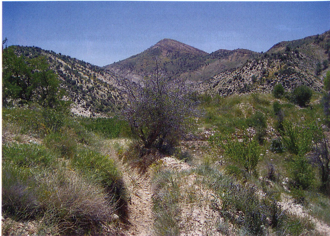
Fig. 7: Habitat of Osmia maxschwarzi sp. n. near Sepidan, Fars province, Iran. Several Astragalus species with long flower corollas, probably the main pollen hosts of O. maxschwarzi , were flowering at this locality.