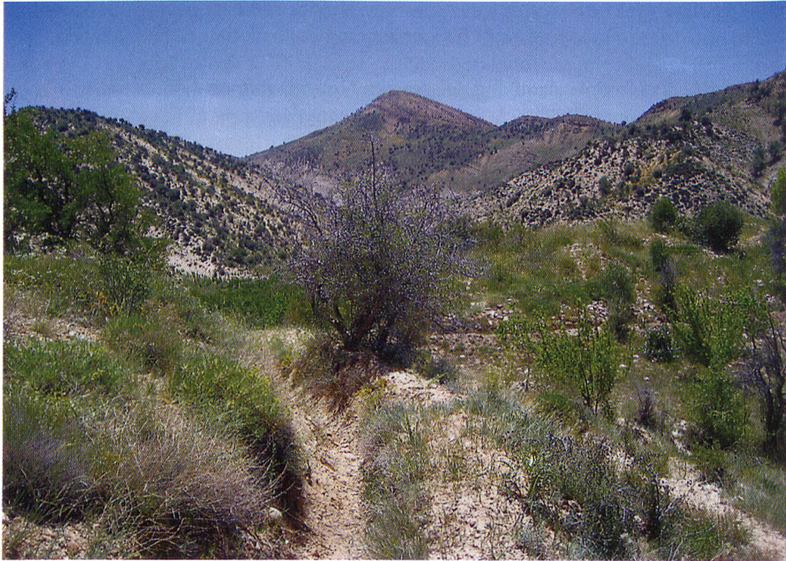
Fig. 7: Habitat of Osmia maxschwarzi sp. n. near Sepidan, Fars province, Iran. Several Astragalus species with long flower corollas, probably the main pollen hosts of O. maxschwarzi , were flowering at this locality.