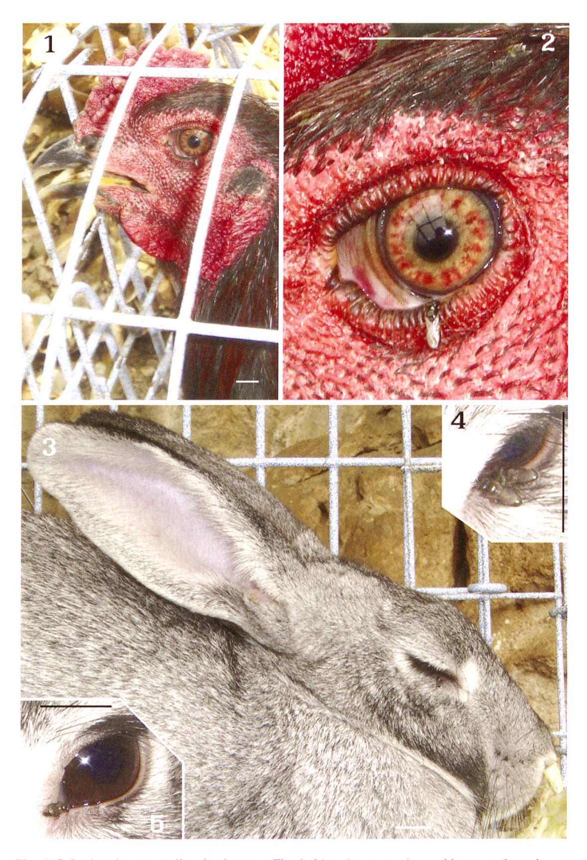
Figs 1–5. Lachryphagous meliponine bees. — Fig. 1. Lisotrigona cacciae sucking tears from the eye of a rooster. Fig. 2. — Same by one L. furva . — Fig. 3. L. furva sipping tears from the closed eye of a rabbit. — Fig. 4. Two L. furva at the eye of a rabbit. — Fig. 5. L. furva imbibing tears from the eye corner of a rabbit. Bar length 1 cm.