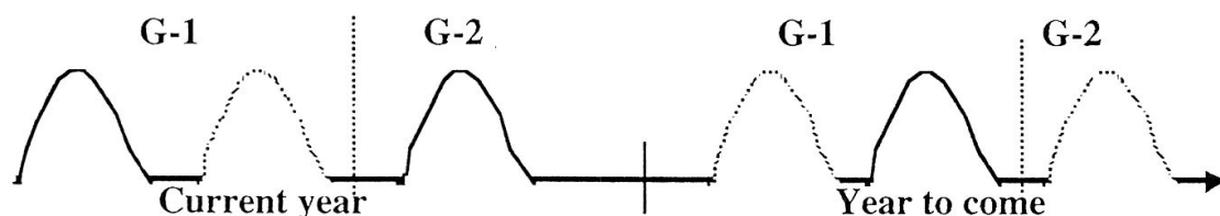
Fig. 1. Scheme of Cydia pomonella 's biological cycle under the normal climatic conditions of Iași.