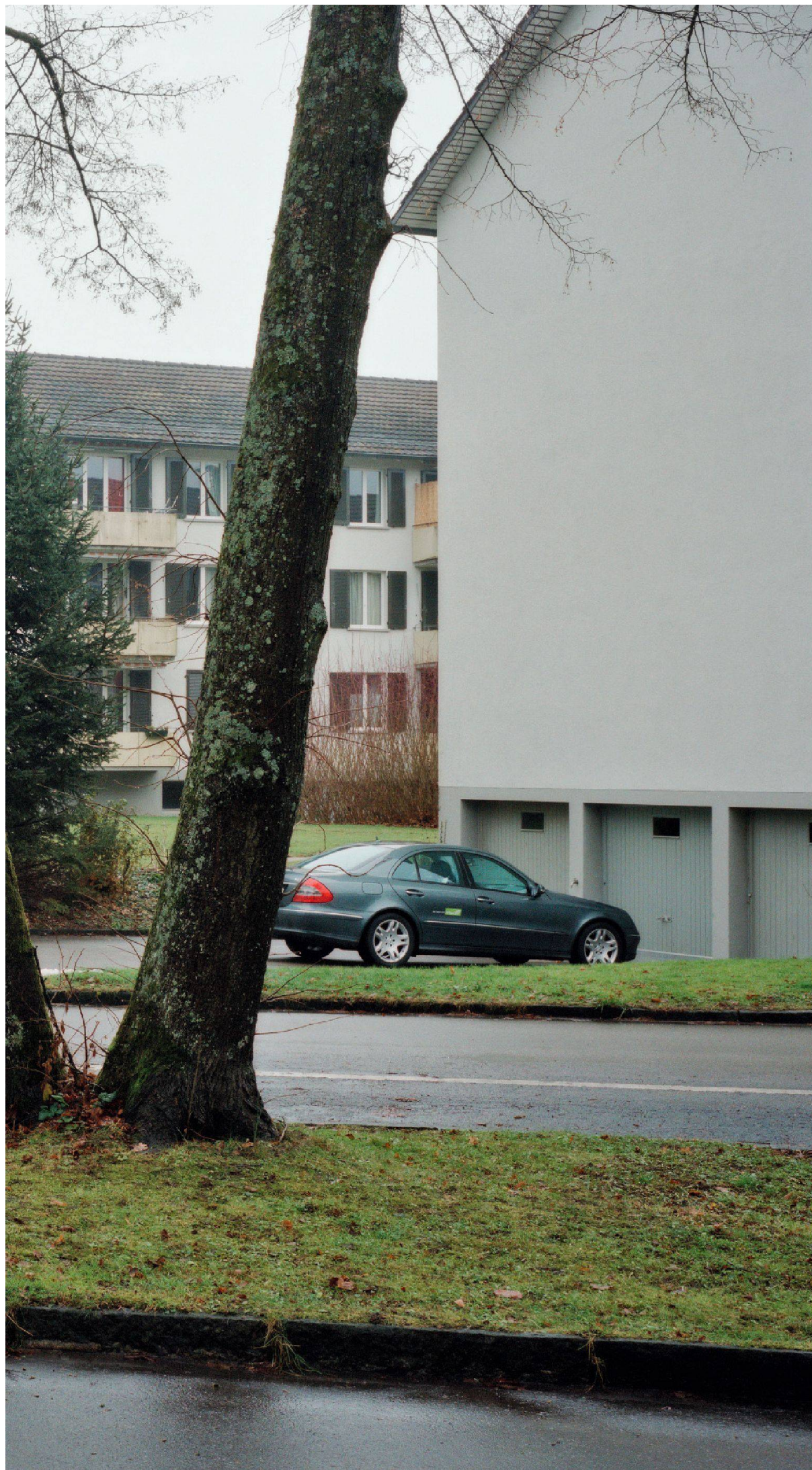
06 Extension and refurbishment of multi-storey building, Weberstrasse, Winterthur