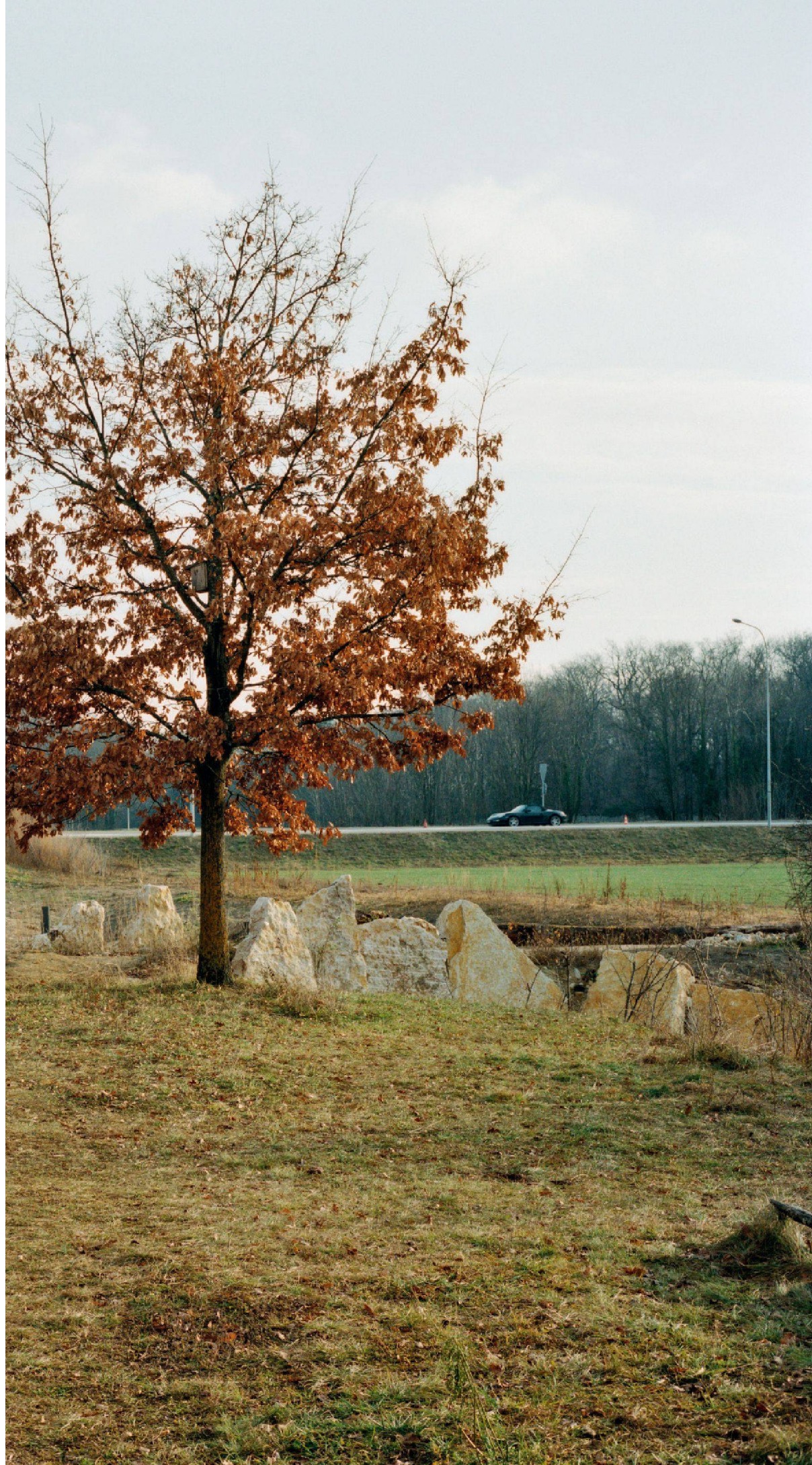
02 IUCN extension, Gland (VD)