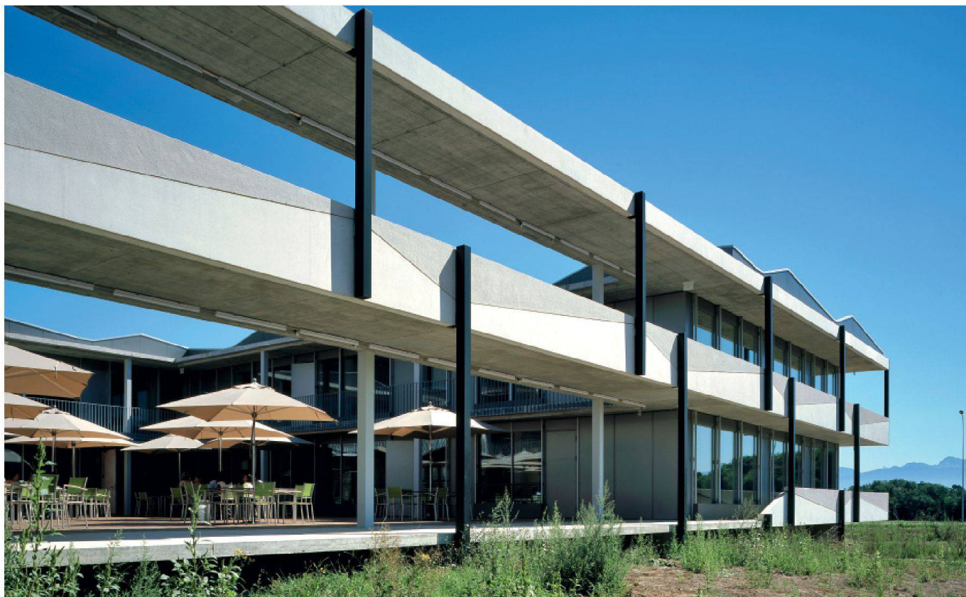
02 IUCN extension, Gland (VD)