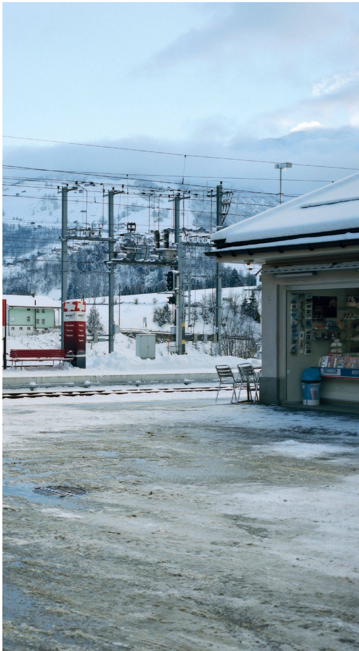
01 Overall project for the Benedictine monastery and agriculture in Disentis (GR)