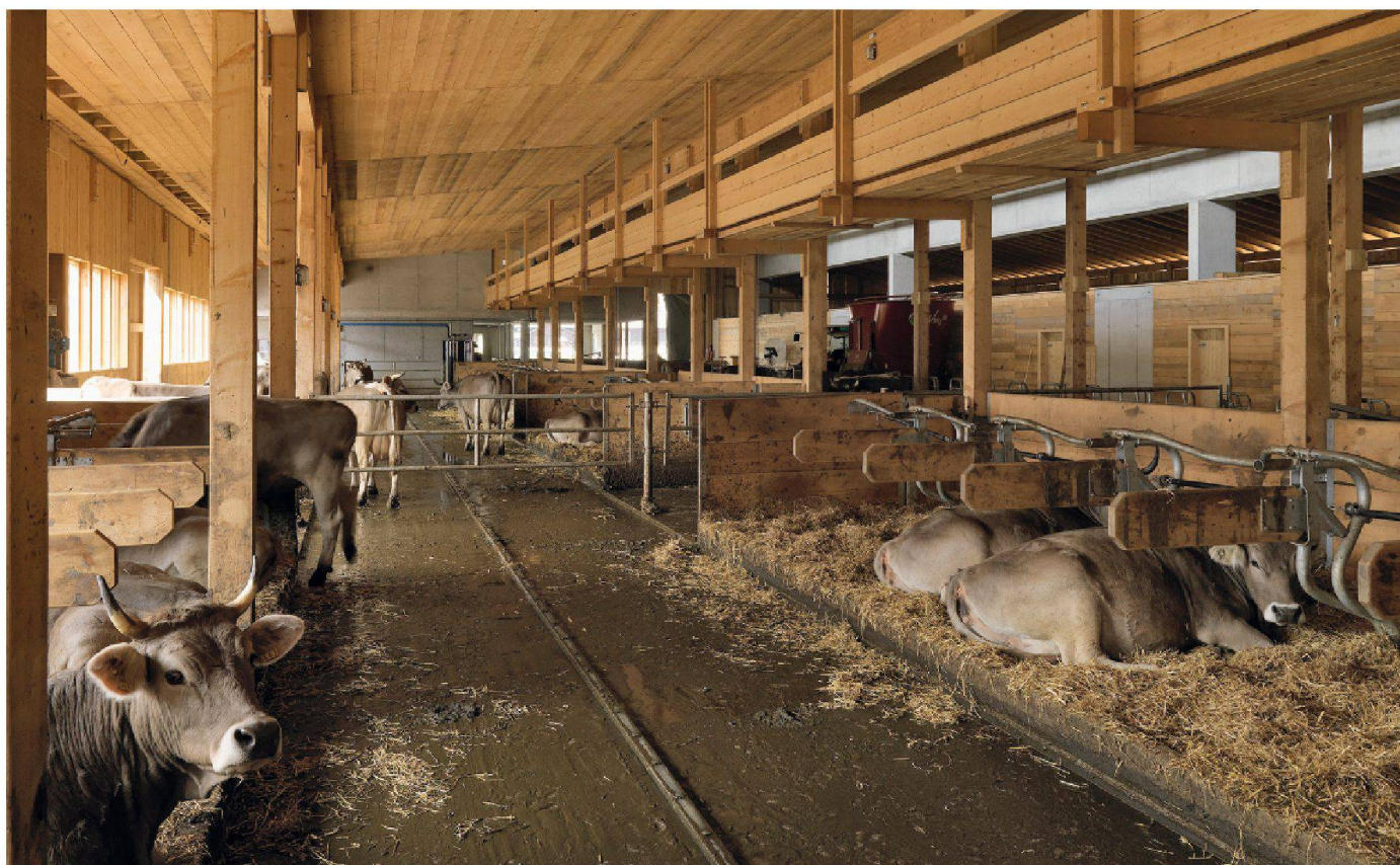
03 Farm at the Benedictine monastery, Disentis (GR)