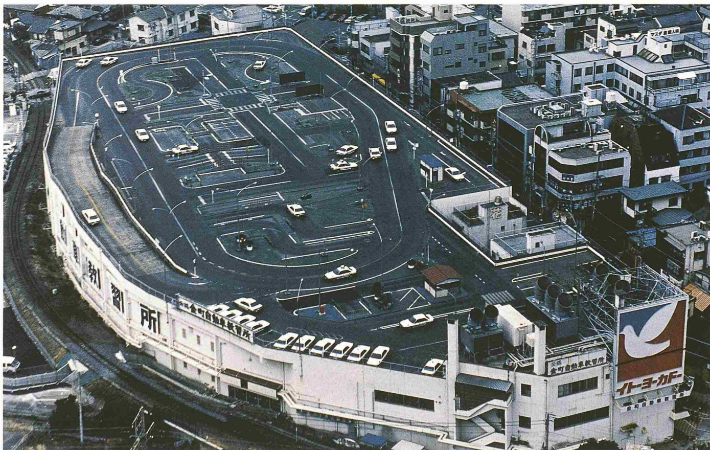
«Super car school»; function: supermarket + driving school/site: kanamachi, katsushika-ku: on top of the double layer supermarket lands a layer of driving school – the site includes the parcels of other people's property which could not be purchased – the condition of the site, framed by the curve of the railroad, is expressed directly in the extruded volume of the building – the entry ramp is framed above by the practice slopes for hand brake starts learner cars, etc.

The buildings of Made in Tokyo are not beautiful. They are not perfect examples of architectural planning. They are not A-grade cultural building types, such as libraries and museums. They are B-grade building types, such as parking, bathing centres, or hybrid containers including architectural and civil engineering works. They are not «pieces» designed by famous architects. What is nonetheless respectable about these buildings is that they don't have a speck of fat. What is important right now is constructed in a practical manner by the possible elements of that place. They don't respond to cultural context and history. Their highly economically efficient answers are guided by minimum effort. In Tokyo, such direct answers are expected. They