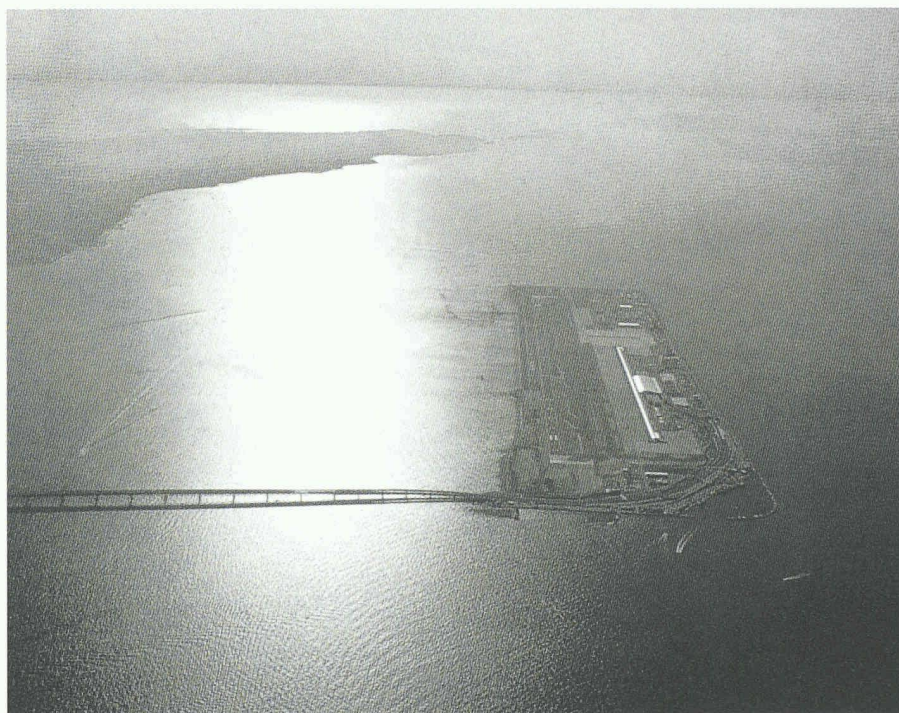
The Kansai Air Terminal, Osaka Bay, Japan