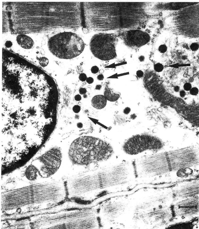
Fig. 1: Electron micrograph, left auricle, rabbit. Atrial specific granules (arrows) are typically found at the nuclear poles. Bar = 0.40 µm.

Immunohistochemical studies at light and electron microscopic levels carried out in man and rat, showed that these granules contain bioactive polypeptides, referred as Atrial Natriuretic Peptide (ANP) or Atrial Natriuretic Factor (ANF), involved in water-electrolyte