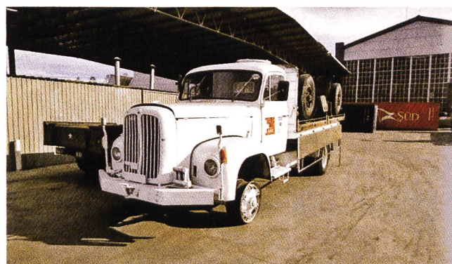
📍 My 1971 Saurer 2DM 4x4 after arriving and being unloaded from the container at the Flinders Adelaide Container Terminal.

My first thought was about how I was going to tell the Missus, but it was too late – it had already been loaded into a shipping container. It turned out that my mate had bought the one he wanted, which was in the original Army green configuration, and was then offered two white ones