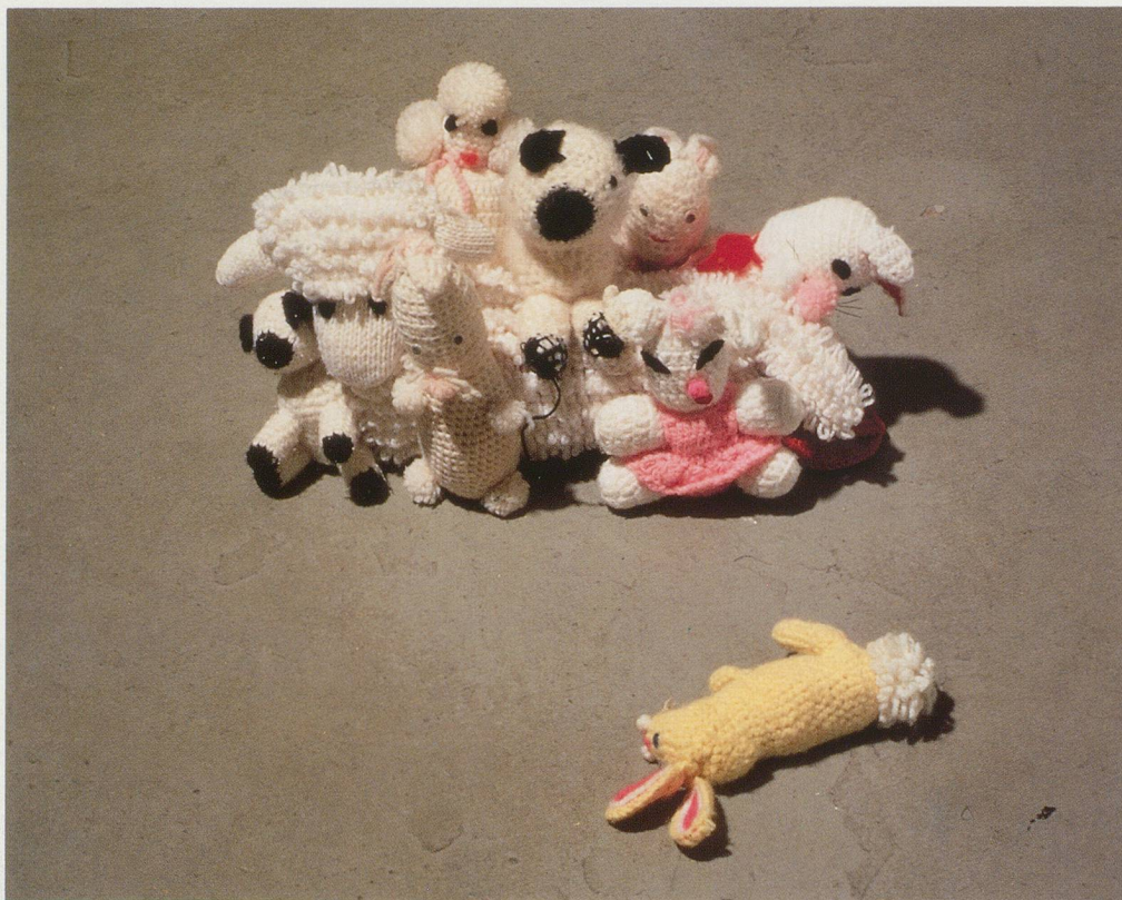
MIKE KELLEY, ALMOSTWHITE, 1990/FASTWEISS, 1990.