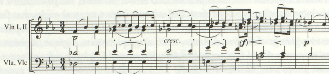
Example 2. Gluck, Orphée et Euridice , Act I, scene 1, mm. 77-82.

Gluck made the pantomime referential by transferring the musical «sighs» from the chorus to the pantomime (Example 2). Similar to mm. 42-45 of the chorus, Gluck highlights the chromatic neighbor notes in the pantomime: B-flat/C-flat/B-flat in m. 78; C/D-flat/C in m. 80; and F/G-flat/F in m. 81. Given that the chromatic neighbor notes accompany Orphée's sighs in mm. 42-45 of the chorus, those in the pantomime can be taken to «embody» the sighs, conveying Orphée's physiological expression of sorrow over Euridice's death during the funeral ceremony. The musical «sighs» reappear in the added ritournelle – a truncated repetition of the pantomime – at the end of the scene while the dancers exit the stage (Example 3, mm. 145-150). Being signifiers of Orphée's grief, the F-sharp, the chromatic lower neighbor in the last quarter beat of m. 145, the E-natural in m. 147, the G-flat in m. 148, the B-natural in m. 149, and the D-flat in m. 150 depict Orphée's voiceless lament of his loss. Within the context of the first scene of Orphée et Euridice , these chromatic neighbor notes thus introduce some referential meanings to the seemingly nonreferential pantomime. From the pairing of recitative and pantomime as well as the ways the musical «sighs» signify, Gluck fuses dance, chorus, and recitative together into a visually and aurally interlaced scene.