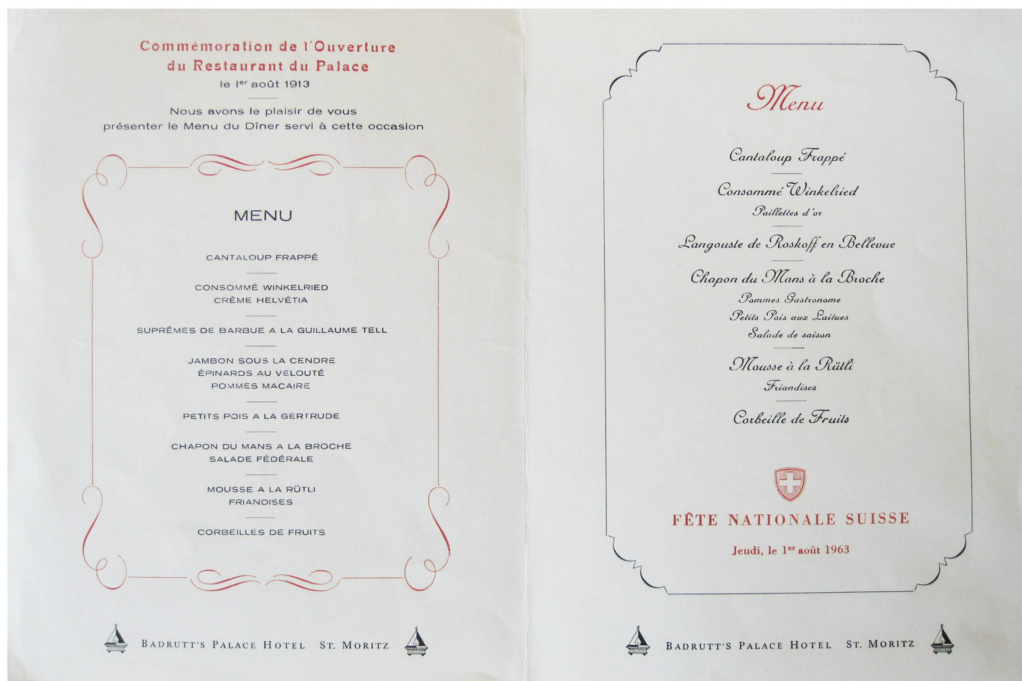
Palace Hotel menu from 1st August 1963.