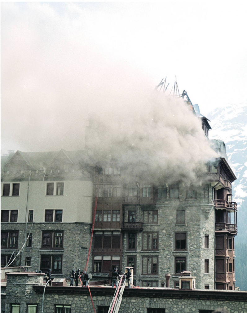
The fire in the tower at the Palace Hotel, 24th June 1967.

implement building work. Hansjürg Badrutt: «Our very personal signature is the fact that we decide on everything that is converted or extended. We even design the interior decoration. My wife and I choose every detail together.»