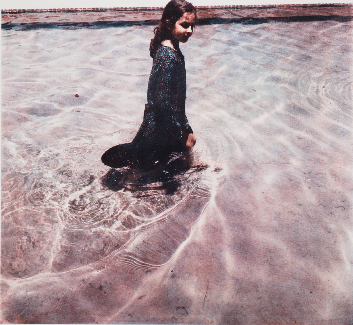
Im Pool Two-colored lithograph on Zerkall Bütten Paper 122 x 94 cm