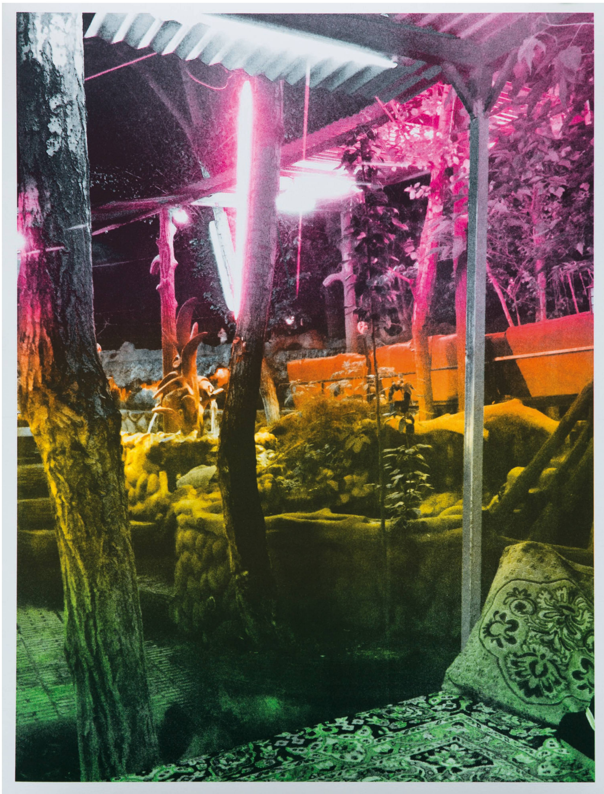
Disco Two-colored lithograph on Zerkall Bütten Paper 87 x 67 cm