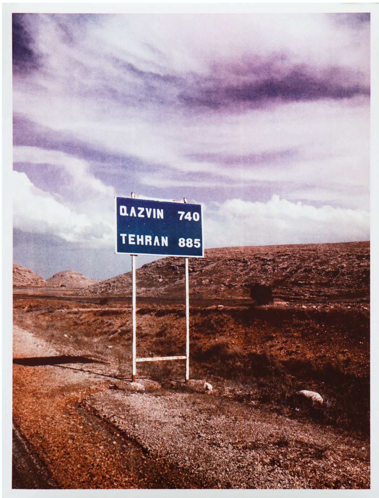
Qazvin/Teheran Two-colored lithograph on Zerkall Bütten Paper 87 x 67 cm