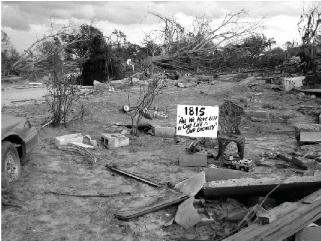
A devastated site at 1815 Jourdan Avenue in the Lower Ninth Ward of New Orleans after the storm surges produced by Hurricane Katrina breached the levees.