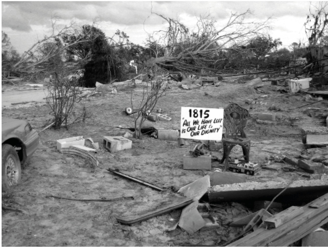
A devastated site at 1815 Jourdan Avenue in the Lower Ninth Ward of New Orleans after the storm surges produced by Hurricane Katrina breached the levees.