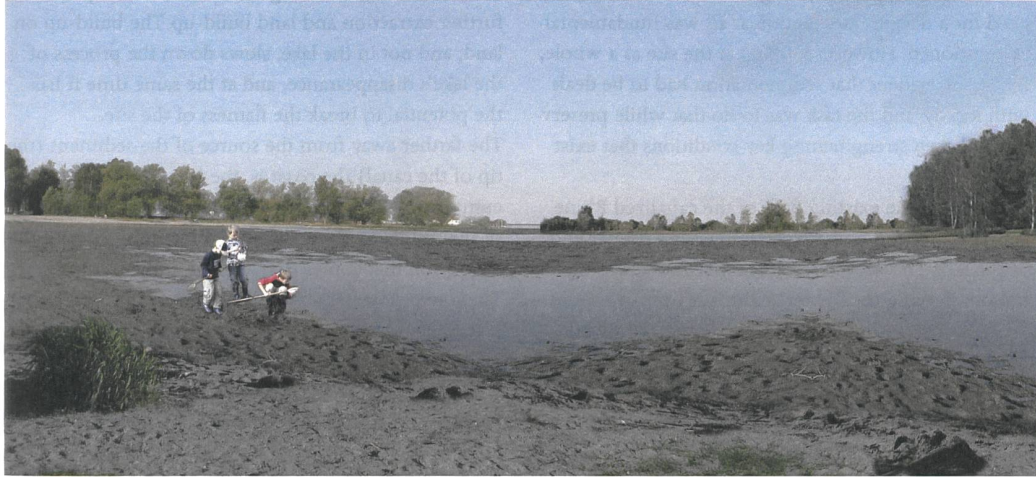
perspective of water's edge