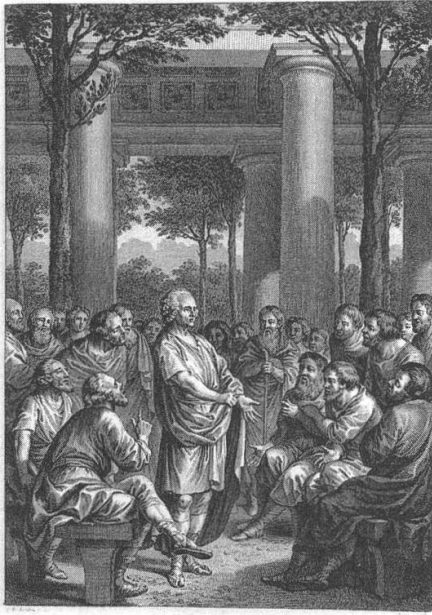
6 [Rousseau dans le lycée d'Athènes], [C.-N. Cochin f. del., Triere sculp.], plate standing at the beginning of the Discours sur l'origine et les fondemens de l'inégalité parmi les hommes , in Œuvres de J. J. Rousseau , [...] édition ornée du superbes figures (Paris: chez Defer de Maisonneuve, 1793–1800), vol. 1 (1793), Politique