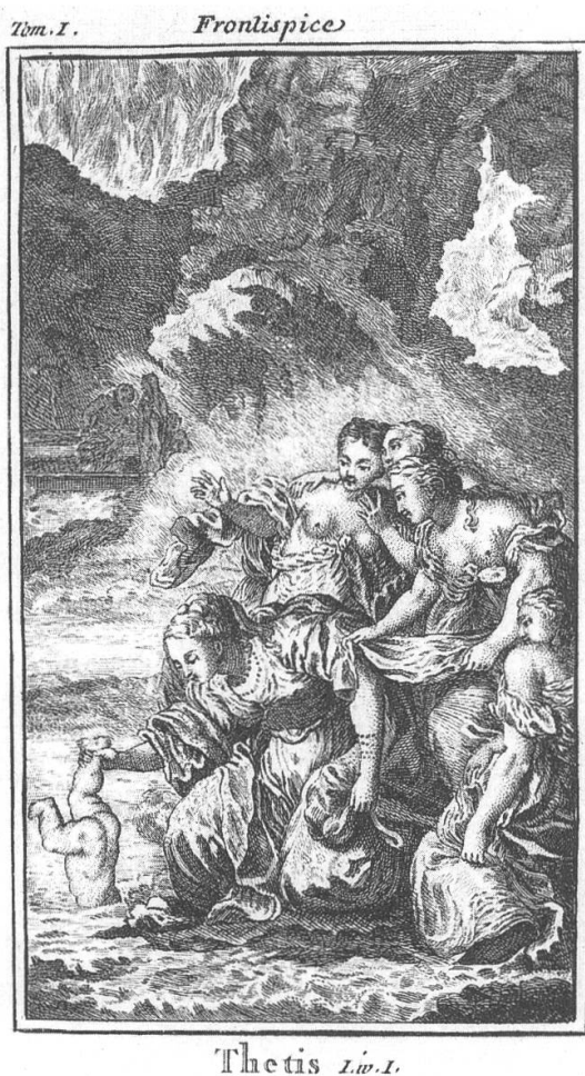
3 'Thetis', in Emile, ou de l'éducation (Amsterdam: chez Jean Néaulme, 1763), frontispiece