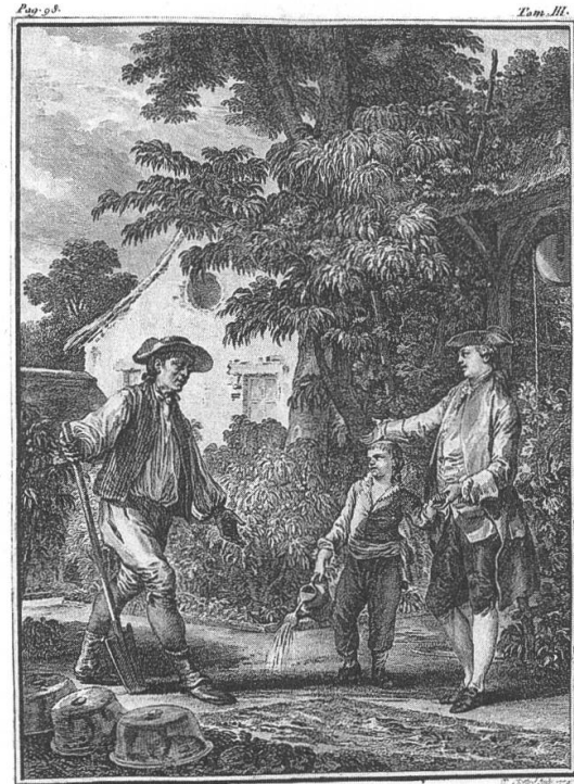
Chacun respecte le travail des autres, afin que le sien soit en sûreté.

V. La Figure qui est à la tête du cinquième Livre & de la quatrième Partie, représente Circé se donnant à Ulysse, qu'elle n'a pu transformer. Voyez P. IV. p. 221.