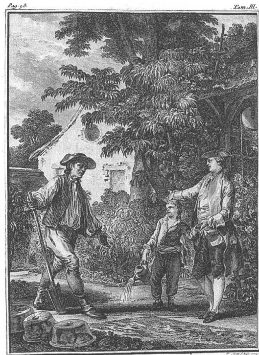
Chacun respecte le travail des autres, afin que le sien soit en sûreté.

V. La Figure qui est à la tête du cinquième Livre & de la quatrième Partie, représente Circé se donnant à Ulysse, qu'elle n'a pu transformer. Voyez P. IV. p. 221.