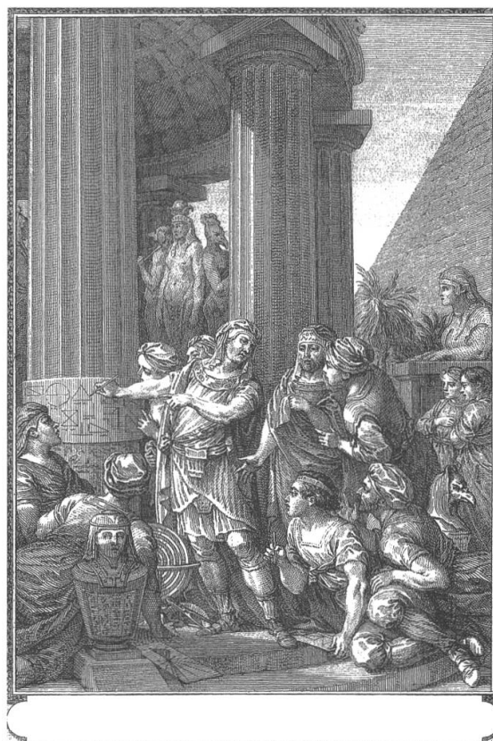
4 'Hermès gravant sur des colonnes les éléments des sciences' [C.-N. Cochin inv., B.-L. Prévost and I.-S. Helman sc.], plate for Collection complète des œuvres de J. J. Rousseau (Genève: Société typographique, 1780-2), vol. 4 (1780), Emile, ou de l'éducation , preceding p. 306

was clothed in Egyptian dress to be presented as Thot (fig. 4). 11 The set of references chosen by Cochin for his illustrations was an international and universal one, which was as recognizable to a reader in England, in Germany or in Italy as to one in France, and which should remain familiar to future generations.