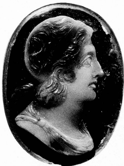
Fig. 5 Cameo. Paris. Bibliothèque nationale.