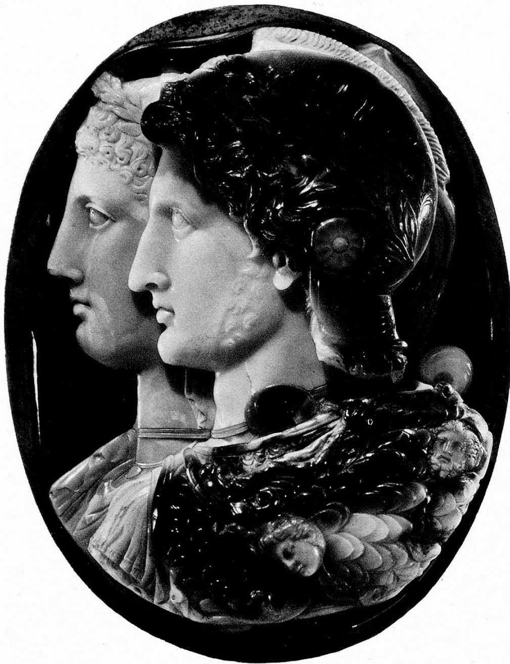
Fig. 2 Cameo. Leningrad. Ermitage.