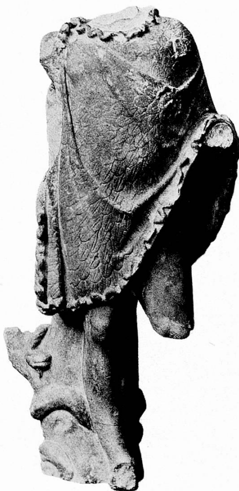
Fig. 8 Marble Statuette. Paris. Musée du Louvre.