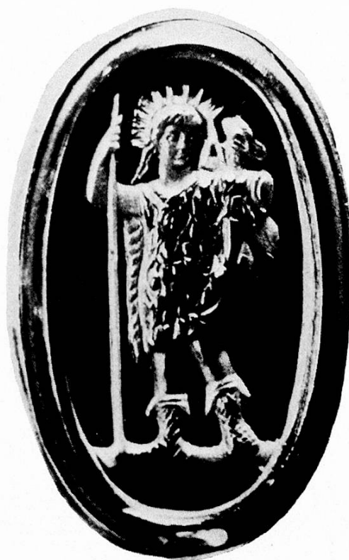
Fig. 6 Cameo. Cammin, Domschatz.