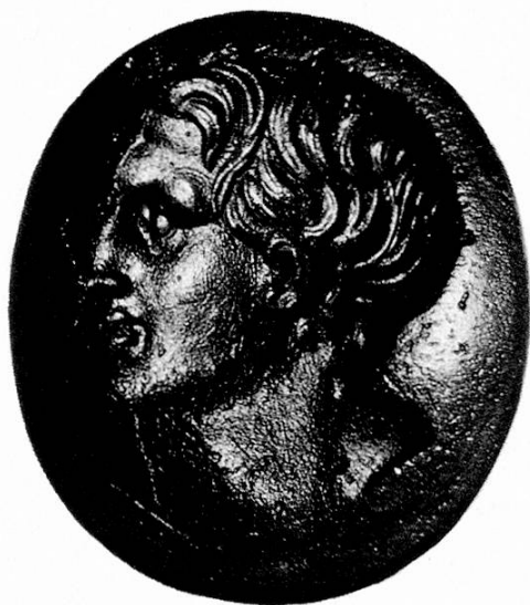
Fig. 3 Glass-paste, cast from Gem. Late IV century B. C. Berlin. Staatliche Museen, Antiken Abteilung.