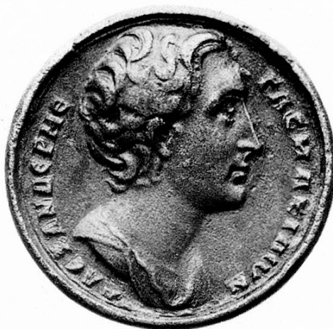
Fig. 4 Contorniate. Auktion 35, Münzen & Medaillen AG, Basle.