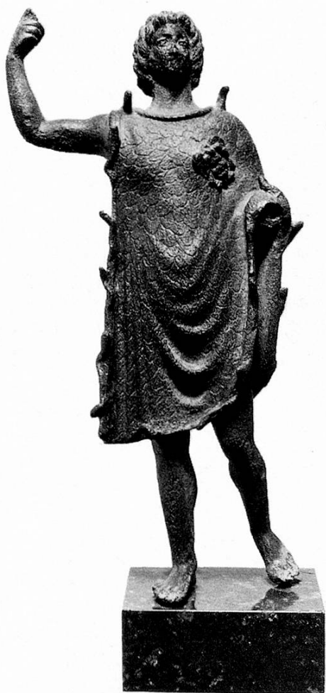
Fig. 7 Bronze Statuette. London. British Museum.