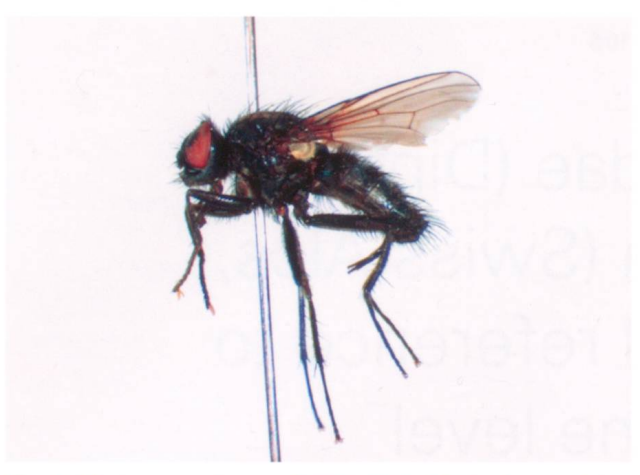
Fig. 1: Thricops aculeipes (ZETTERSTEDT 1838), a boreoalpine species (Plan Lung, 2395m, 3.VIII.2004, male). Note the curious elongate inner process on the posterior tibia, typical of the male of this species, the function of which is unknown.