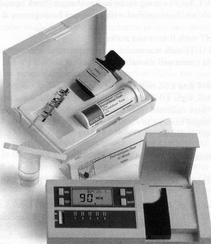
Figure 1 Reflectoquant® peroxidase test