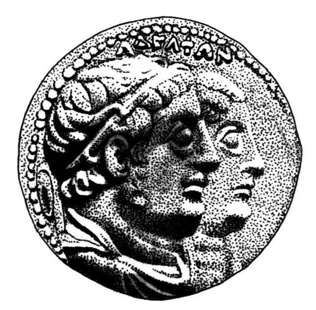
Fig. 2. Ptolemy II (reign: 282–246 BC) and wife Arsinoë. From Gisela M. A. Richter, The Portraits of the Greeks III (London 1965) fig. 1781.

The garden and outbuildings of the royal palaces<sup>34</sup> housed the collection of animals in what may be identified as one of the earliest known menageries<sup>35</sup> and, by all accounts, the most celebrated of the ancient ones<sup>36</sup>. Different in organization and aims from the Egyptian sacred enclosures<sup>37</sup> and from the Assyrian game parks<sup>38</sup>, it was an archetype of later zoos in much the same way as the Ptolemies' library was for book collections<sup>39</sup>. Ptolemy II's animals were exhibited to the general public on special occasions such as the whole day procession ( \pi o \mu \pi \eta ) of the second Ptolemaieia ( \Pi \tau o \lambda \epsilon \mu \alpha (\epsilon i \alpha) , which took place at a date still open to discussion, some time between 280/79 and 271/70<sup>40</sup>, and also displayed to foreign visitors as an outward sign of power and prestige<sup>41</sup>.