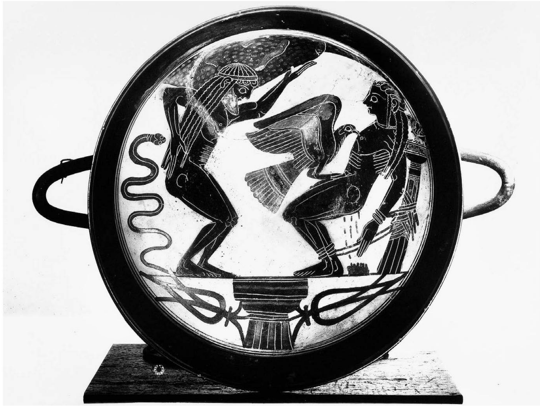
Fig. 3. Atlas and Prometheus. Laconian cup (560 BC), cf. p. 2.