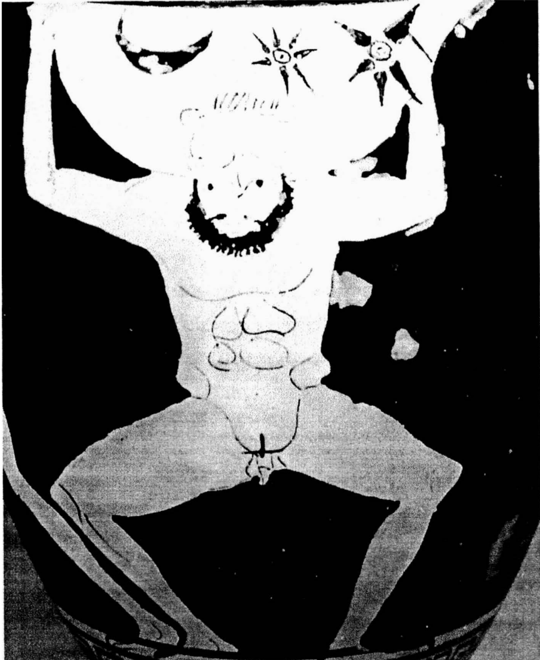
Fig. 1. Herakles in the Farnese position, Campanian amphora (450 BC), cf. p. 3.