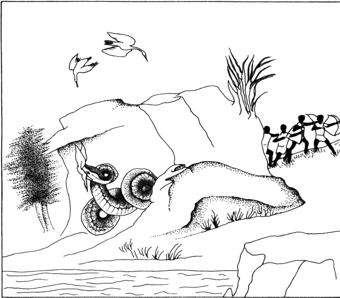
Fig. 1. Nile mosaic of Palestrina, end of second century BC (upper level, section 1). From P. G. P. Meyboom, The Nile Mosaic of Palestrina. Early Evidence of Egyptian Religion in Italy (Leiden 1995) fig. 9.

elephants forced him after the first Syrian war (274–272), if not before 31 , to rely upon Africa to maintain his contingent 32 ; second, collecting both wild and domestic animals. The fragmentary nature of the evidence leaves undecided which of these activities, if either, was ever the most favoured by Ptolemy himself. In Burstein's opinion 33 , Agatharchides “singled out Ptolemy II's interest in the exotic rather than military considerations as the main factor motivating his activities in the Sudan and along the Red Sea”.