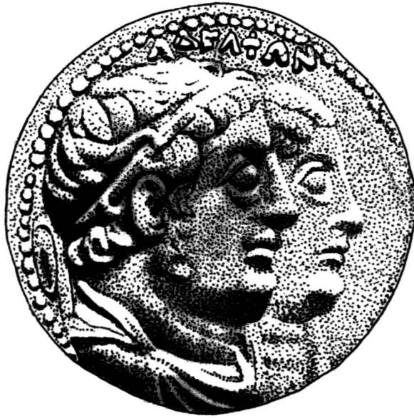
Fig. 2. Ptolemy II (reign: 282–246 BC) and wife Arsinoë. From Gisela M. A. Richter, The Portraits of the Greeks III (London 1965) fig. 1781.

The garden and outbuildings of the royal palaces 34 housed the collection of animals in what may be identified as one of the earliest known menageries 35 and, by all accounts, the most celebrated of the ancient ones 36 . Different in organization and aims from the Egyptian sacred enclosures 37 and from the Assyrian game parks 38 , it was an archetype of later zoos in much the same way as the Ptolemies' library was for book collections 39 . Ptolemy II's animals were exhibited to the general public on special occasions such as the whole day procession (πομπή) of the second Ptolemaieia (Πτολεμαίεια), which took place at a date still open to discussion, some time between 280/79 and 271/70 40 , and also displayed to foreign visitors as an outward sign of power and prestige 41 .