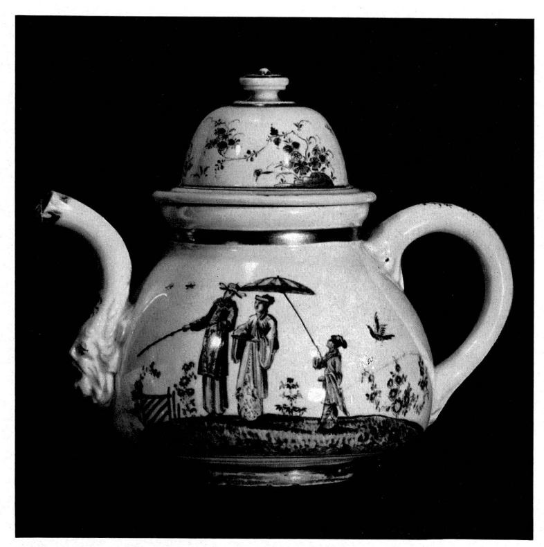
Abb. 1. Teapot and cover by J. G. Herold, Meissen, KPF, 1724.