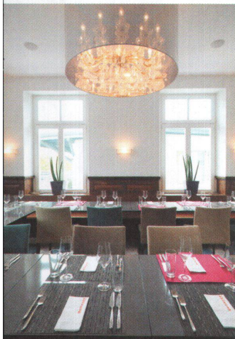
^ Simple but elegant: "Bellevue" in Ittigen.