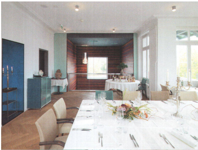
<The "Bellevue" Restaurant in Ittigen: a transition from the old days to modern times.