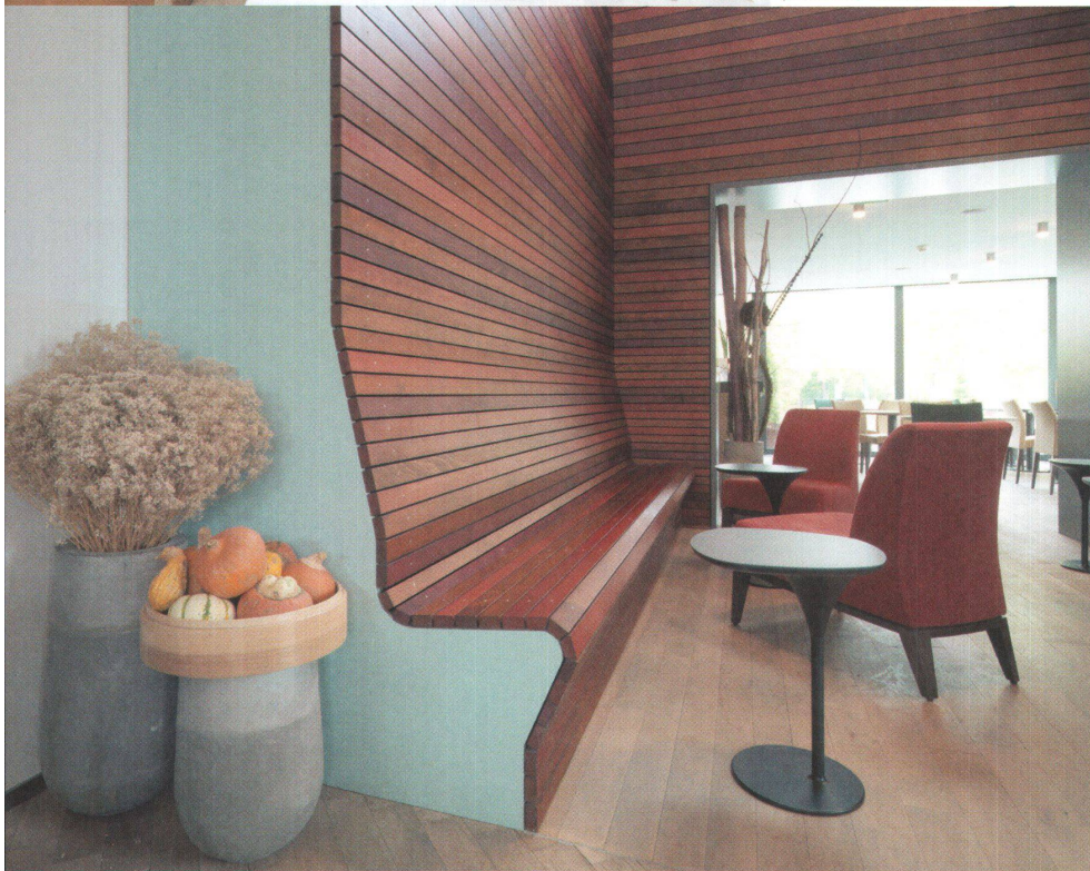
✓ Railway station style benches as an unobtrusive solution to architectural problems on interfaces.