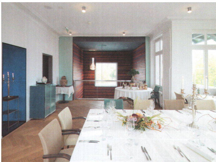
<The "Bellevue" Restaurant in Ittigen: a transition from the old days to modern times.