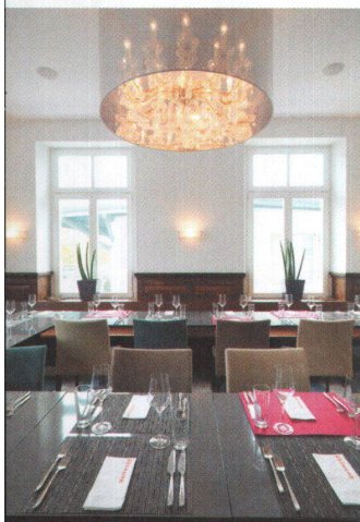
^ Simple but elegant: "Bellevue" in Ittigen.