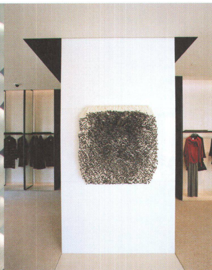
<Chanel Store, Hong Kong, 2005: works of art play a role in Peter Marino's designs.