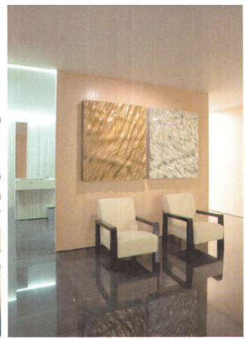
^Private bank, New York, 2003: Waiting room, perfection to the last detail.