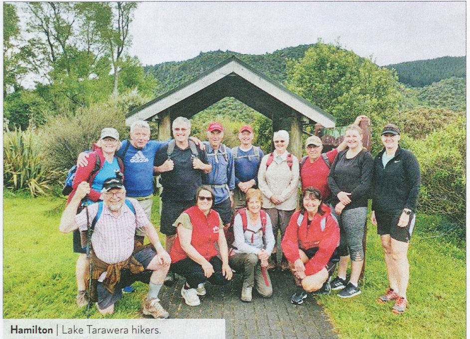
Hamilton | Lake Tarawera hikers.

21: Family Picnic – advance notice. 50 metre medal shooting will be held the previous day. Further details in the February Helvetia.