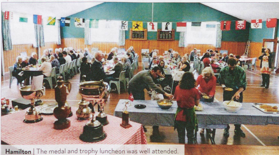
Hamilton | The medal and trophy luncheon was well attended.