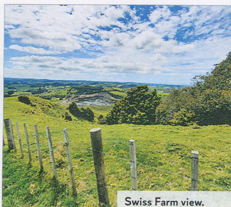
Swiss Farm view.