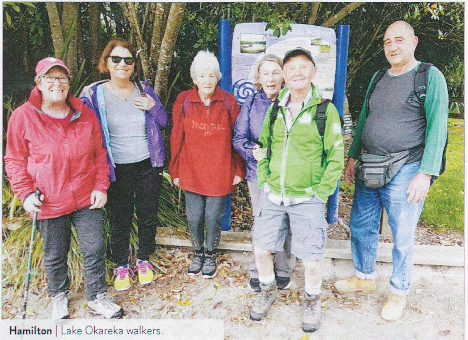
Lake Okareka walkers.