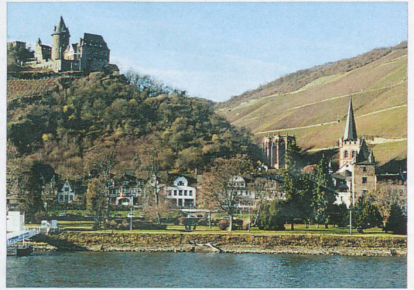
Christmas cruise | Cruising along the picturesque Rhine.