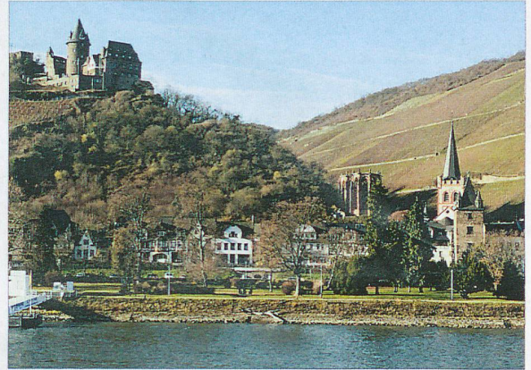
Christmas cruise | Cruising along the picturesque Rhine.