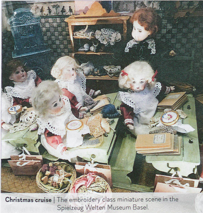
Christmas cruise | The embroidery class miniature scene in the Spielzeug Welten Museum Basel.