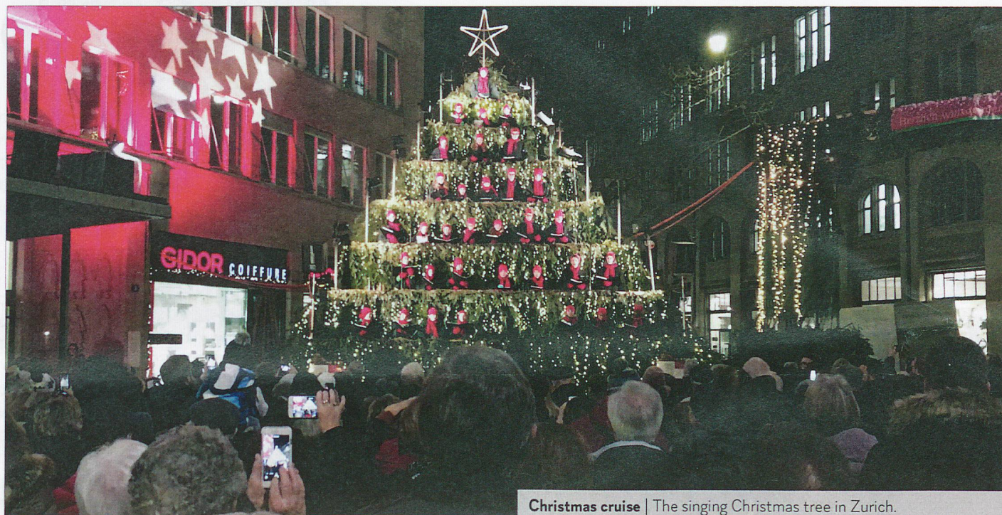
Christmas cruise | The singing Christmas tree in Zurich.

filled to bursting with Christmas cookies, decorations and delights. There are several markets here, many of them themed.