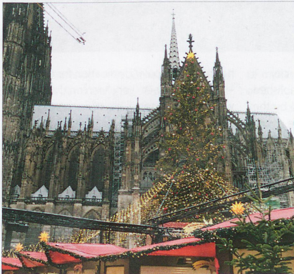
Christmas cruise | The Köln market with its giant Christmas tree in the shadow of the cathedral.

markets was in the giant one right next door to Köln's Gothic Cathedral. It was quite an experience for us Kiwis who are not used to being in such crowds – there was nowhere to move and it was hard to see anything. A trip back there the following morning was much more enjoyable with less people about. We tried lots of foods including fantastic giant bacon, onion and cheese decorated pretzels and potato fritters with apple sauce.