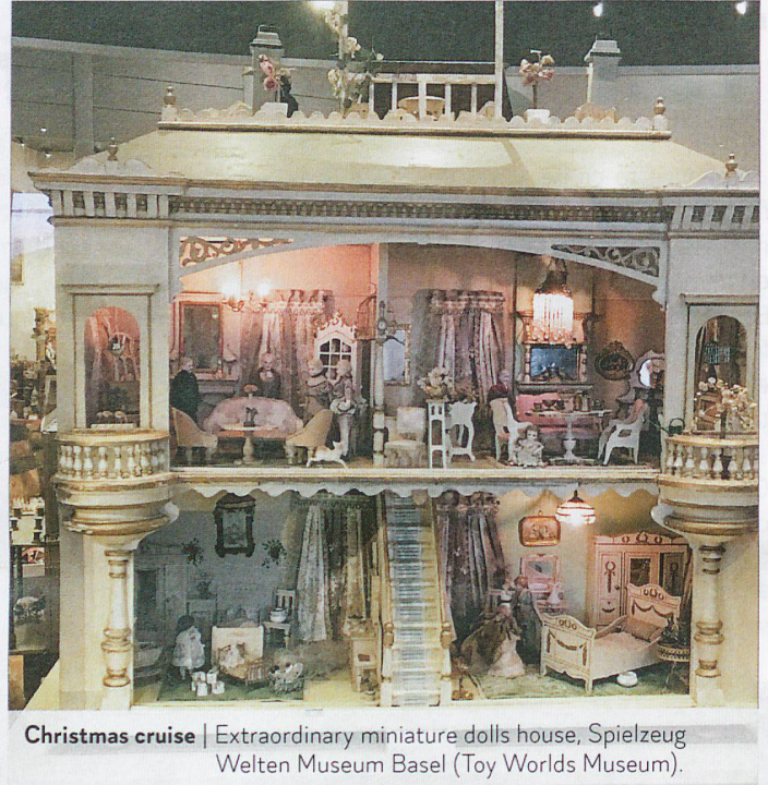
Christmas cruise | Extraordinary miniature dolls house, Spielzeug Welten Museum Basel (Toy Worlds Museum).

regional specialties such as Rüdeshimer coffee – with brandy and whipped cream, specialty German sausages served with sauerkraut and noodles, lebkuchen, pfeffernuesse.