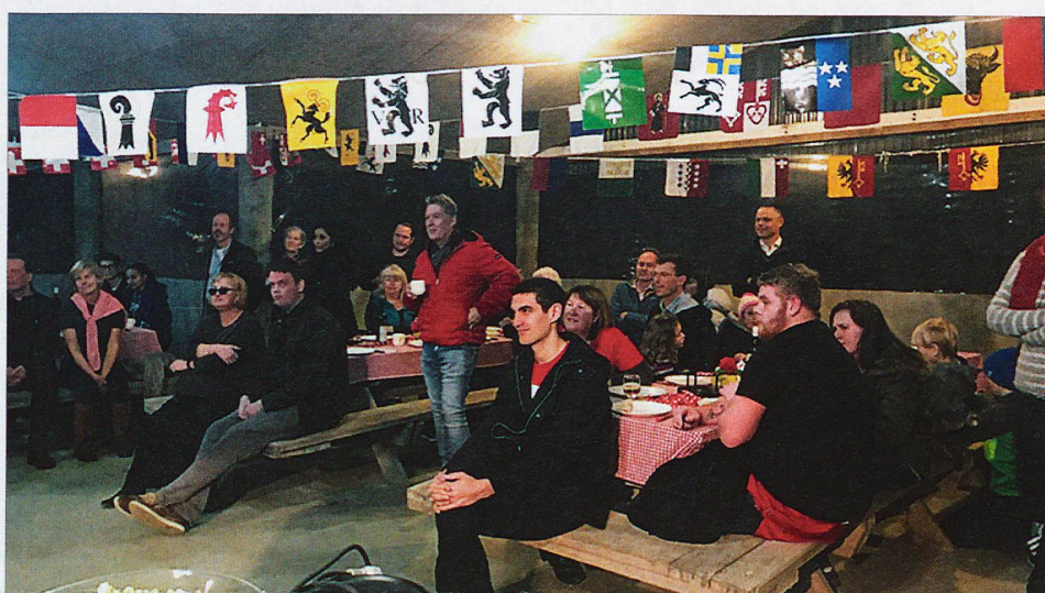
Auckland | Auckland members enjoyed a delicious fondue dinner at their party-ready Swiss Farm location.