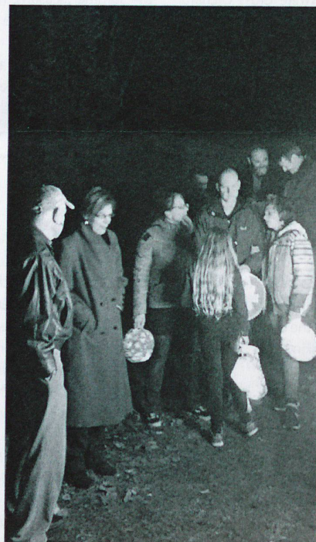
Wellington | Everyone enjoyed socialising by the 1st of August fire.