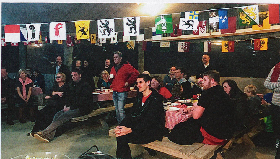
Auckland | Auckland members enjoyed a delicious fondue dinner at their party-ready Swiss Farm location.