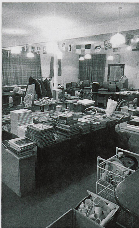
Wellington | Our garage sale display.