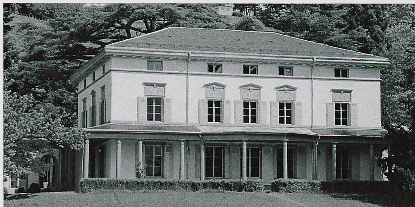
Charlie Chaplin | Charlie and Oona Chaplin's unique family home (turned museum), Manoir du Ban. They raised their 8 children here.

Throughout his career he released approximately 81 films with about 35 of them highlighted at Chaplin's World. Entire Hollywood scenes have been reproduced