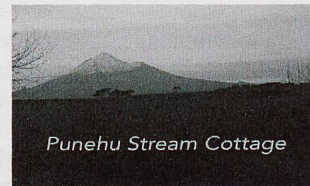
Punehu Stream Cottage

We hope our members are all well and keeping safe in their bubbles during the different levels of lockdown.