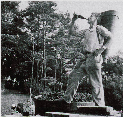
Sampling during grape harvest

From there I went back to Schneisingen for a few months. I then became a tractor driver in Reinach AG; the farm was very spread out over a large area as the boss was leasing any available land and small plots as they became available. The livestock consisted of about 40 cows, young stock, pigs and the boss' army horse. The area was well-known for its cigar manufacturing and we also did quite a lot of contract work, carting the by-products from the factories. The farm also had a combine harvester which at the time were not widespread so I spent a lot of time driving the harvester during late summer and autumn. As opportunities for farming in Switzerland were very limited and considering I wasn't from a farming family, thoughts of immigrating were still uppermost in my mind and so I applied for a job in Canada as a tractor driver. But the job did not eventuate so I made enquiries as to where to go outside Europe for farming and was advised either New Zealand or Canada. I decided New Zealand was climatically better. I knew little about New Zealand and spoke no English before