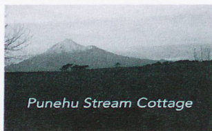
Punehu Stream Cottage

In 2014, a narrow majority of Swiss voters (50.3%) accepted a plan to allow the government to control immigration into Switzerland from the EU. This eventually resulted in a compromise that gives Swiss residents priority over foreign ones when applying for jobs.