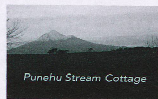
Punehu Stream Cottage

As you arrive, please support the Swiss Pro Patria Foundation by purchasing an emblem (Abzeichen) - all funds raised will go towards the maintenance and upkeep of many heritage projects in Switzerland.