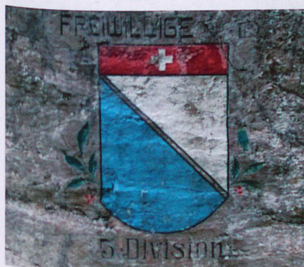
The memorial to the soldiers and volunteers who cut the track out of the rock face.

During the night we had rain, thunder and lightning but by morning it had cleared. Beni dropped us off at Hauenstein and we commenced our walk in a south-westerly direction. From now on we carried our backpacks of about 13-14 kilos. We hiked through colourful grain fields, mixed farms and forests. Had some light rain as we walked up a road that was cut out of the side of a very steep hillside during the world wars by soldiers and volunteers for defense purposes.