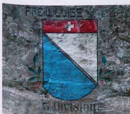
The memorial to the soldiers and volunteers who cut the track out of the rock face.

During the night we had rain, thunder and lightning but by morning it had cleared. Beni dropped us off at Hauenstein and we commenced our walk in a south-westerly direction. From now on we carried our backpacks of about 13-14 kilos. We hiked through colourful grain fields, mixed farms and forests. Had some light rain as we walked up a road that was cut out of the side of a very steep hillside during the world wars by soldiers and volunteers for defense purposes.