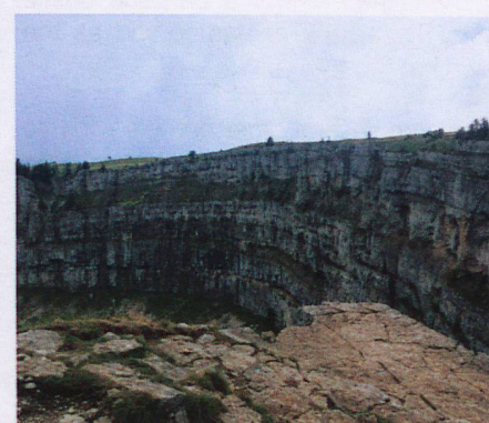
The impressive Creux du Van