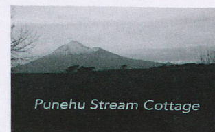
Punehu Stream Cottage

5 Milford Rd, Milford, Auckland • Phone 489-9737 find us on Facebook under Swiss Café and Bakery