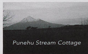
Punehu Stream Cottage

5 Milford Rd, Milford, Auckland • Phone 489-9737 find us on Facebook under Swiss Café and Bakery