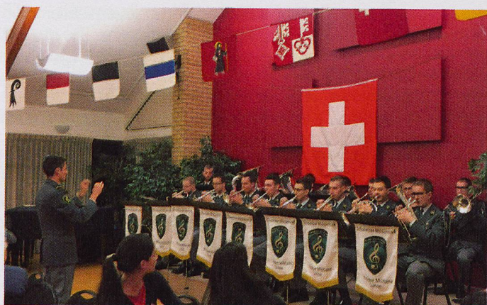
1st of August celebration in Auckland