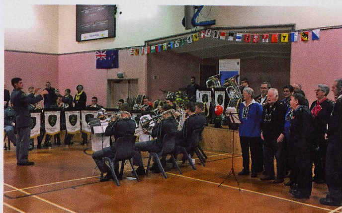
Performing in Taranaki