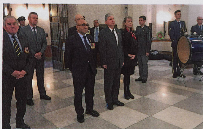
Last Post Ceremony at the National War Memorial together with the Minister of Defence, the Hon Ron Mark