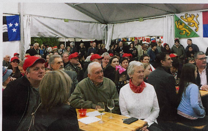
Big crowd at the residence on the 1st of August