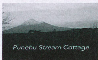
Punehu Stream Cottage

15th April - Cowbell semi-final in Auckland: Participants are needed to compete in the bowling, cards and shot-put (we'd appreciate some