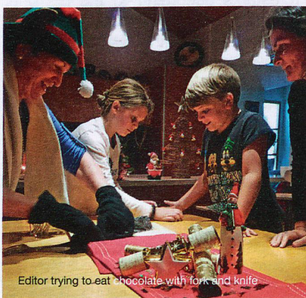
Editor trying to eat chocolate with fork and knife