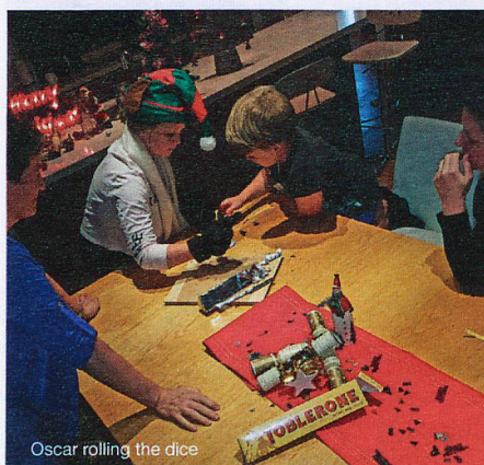
Oscar rolling the dice