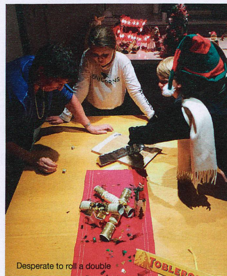
Desperate to roll a double