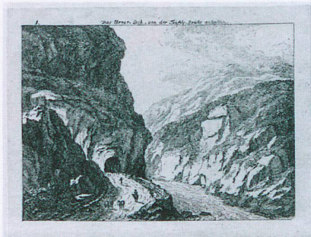
The Schoellenenschlucht (gorge) and Unerloch, Switzerland's first alpine tunnel, drawn by Salomon Gessner, 1781

became a much safer and easier way to reach destinations crossing alpine terrain. For many years tunnel building was achieved using only explosives and physical labour to cut through the rock and earth, but in more recent decades, tunnel boring machines have taken over, chewing their way ever faster through a multitude of hills and mountains. If averaged out, over the past 300 years, Switzerland has built around 11 meters of tunnel per day - although most of this has taken place only over the past century or so. To date, a total of about 814 km of road tunnels, and 424 km of rail tunnels have been constructed.