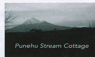
Punehu Stream Cottage