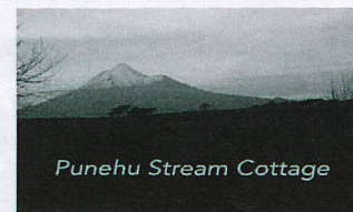
Punehu Stream Cottage