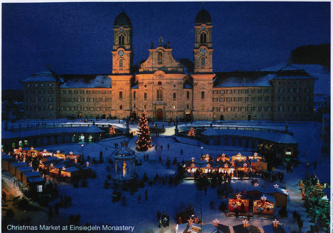
Christmas Market at Einsiedeln Monastery