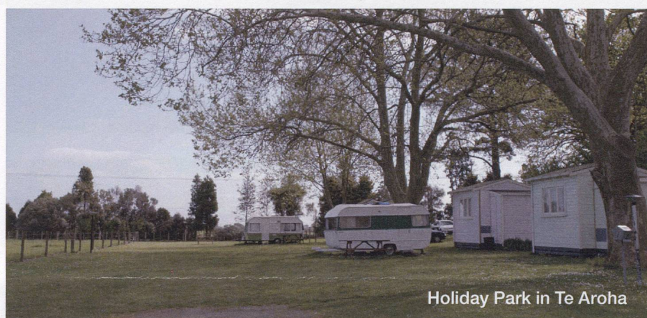
Holiday Park in Te Aroha