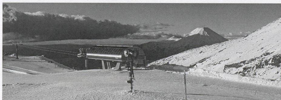
This new chairlift recently replaced Haensli's 1954 one!!!