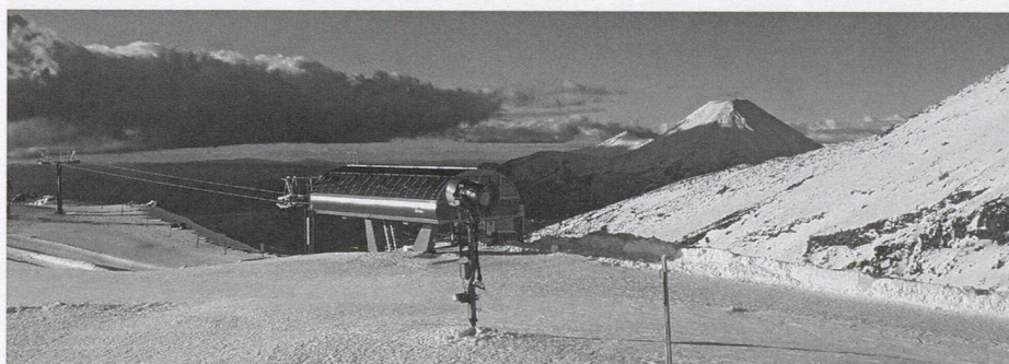
This new chairlift recently replaced Haensli's 1954 one!!!