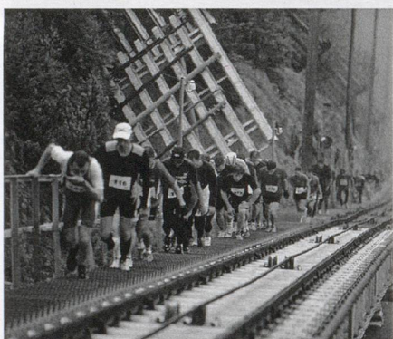
Climbers during the annual Niesen Stairway Run

The cruelest thing about this Swiss world record? The Niesen stairway is really intended for maintenance workers. The steps are built right beside the funicular tracks, essentially making the climb by foot pointless.