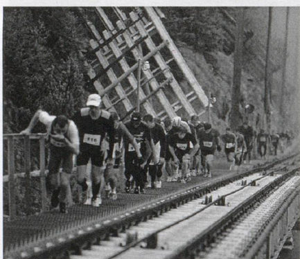
Climbers during the annual Niesen Stairway Run

The cruelest thing about this Swiss world record? The Niesen stairway is really intended for maintenance workers. The steps are built right beside the funicular tracks, essentially making the climb by foot pointless.