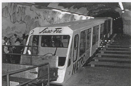
The Metro Alpin funicular waits to take passengers to the top of the Allalinhorn.

Superficially, Switzerland operates just a single underground railway system, in Lausanne. But when you dig deeper, you will find that it also operates the world's highest.