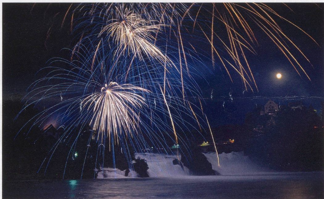
Photo Rheinfälle celebrations

Since 1891, the first of August has been celebrated as Swiss National Day. The date refers to an historic alliance concluded in 1291 by the three cantons of Uri, Schwyz and Unterwalden. This alliance was to become the focal point around which the Switzerland of today was built over the next 500 years. Men from these three cantons "at the beginning of the month of August 1291" swore eternal allegiance to one another, promising mutual help and assistance. The alliance was mainly formed against the Habsburgs, who were striving to strengthen their position in the strategic region leading to the Gotthard Pass at the time.